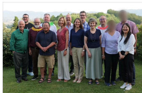
CTC Global Coach Directors Retreat, Pistoia, Italy, June 19-22.