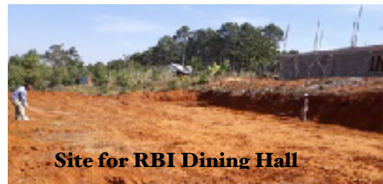
Site for RBI Dining Hall

2. Dining Hall: This year we plan have a dining hall constructed at the cost of $5000 which can accommodate 50 people. Please pray for this need. The size will be 70X20 feet with attached kitchen and bathrooms.