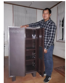
Gift from Bangalore Pres. Church, Steel almirah from Elim Pres. Church