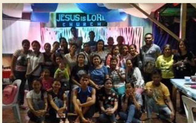
Photo: After the distribution of Sama, Tagalog, and Cebuano Bibles and Tausug Bible study materials at JIL church in Bongao, Tawi-Tawi, we gathered for an evening of fellowship declaring God's mercy and grace towards His people and work, and proclaiming the mighty things He did and is doing in our midst.

The third week of March we traveled to TawiTawi to distribute Tagalog, Cebuano and Sama Bibles, and Bible study materials in Tausug . This project was made possible through the help of Central Presbyterian Church. We also gathered together for an evening of fellowship at JIL Church in Bongao.