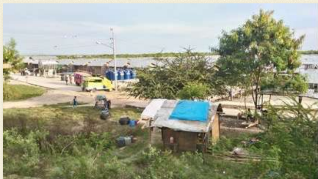
Photo: our neighbors in Mampang about 20 meters from the new center. Sea water comes under these government constructed houses during high tide. Close to 1000 Muslim families displaced during the Zamboanga City siege by Muslim rebels are taking up residence here

Ministry Update from Rene and Lani Quimbo serving in the Philippines with PMI