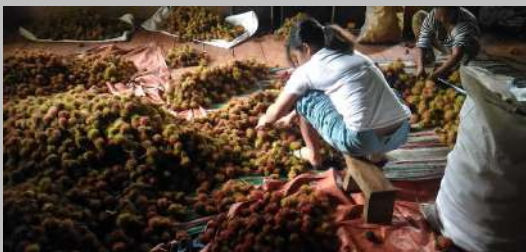
Selection of rambutan fruit (related to lychee).

At the supermarket recently, we met one of the girls in one of our Bible studies 17 years ago. She is married, and she introduced her husband, who was with her, to us. She said it has been a long time since she came to church. In the middle of our conversation, she suddenly asked if she could come for a one-on-one Bible study, she was in tears. We were a bit surprised, but we enthusiastically set a schedule with her. May the study of God’s word revive her longing to know and love God. We covet your prayers.