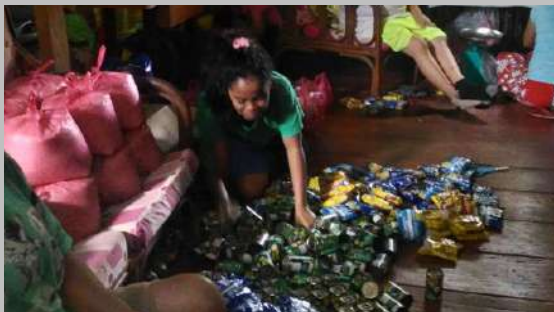
Preparing food packs to be distributed to Sunday worshippers at Hillside Christian Fellowship during recent unrest near Lacolac.

A training was conducted for youth to prepare them to get involved in our Sunday school for children not only at the Portal Christian Fellowship , but at the House of Hope Christian Fellowship as well. The young people who struggled with temptations common to them and have can effectively share their experiences with children who are just beginning their spiritual journey.