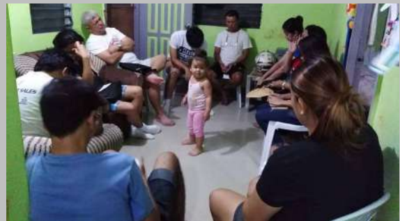
Portal Church members take turns in hosting Friday Bible study, prayer meeting, and fellowship in their homes.