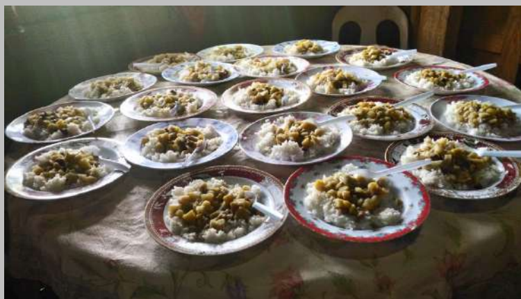
Serving hot lunch to students of Lacolac Elementary School after lunch break Bible study every school day.

we endeavour to teach God's Word to the children who come trusting God that by His grace these children will learn and become wise.