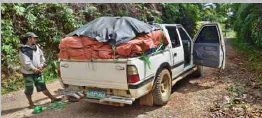
Truckload of rambutan fruit on its way to Cagayan de Oro City to be sold.

Thank you all for your partnership, for helping us with your prayers and gifts, enabling us to minister with a grateful heart. May the Lord direct us in everything we do with His gracious favour!