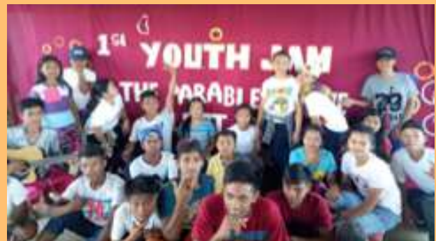
First Youth Jam at Hillside Learning Center held last weekend of October

We praise God for the help we received from Midway Presbyterian Church to finish the construction of the House of Hope Ministry Center and for the purchase of necessary church furniture and a musical instrument. We hope to finish the construction of the House of Hope Ministry Center at the end of the first quarter. As of this writing, we are still meeting in one of the Bajau houses in Cagayan de Oro for the Wednesday Bible study and prayer meeting, and Sunday worship service. Please pray with us as we plan to start holding adult, youth and children Bible study and fellowship at the Center as soon as possible.