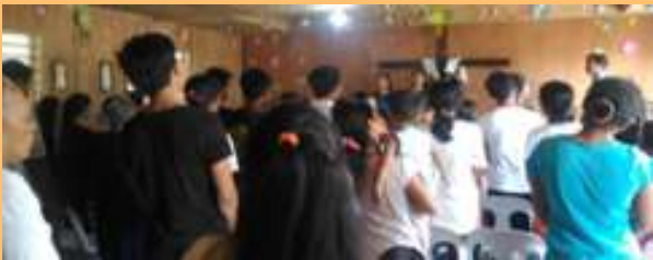
Mampang Ministry Center on Dec.16, 2018

Our lunch break children Bible study participants came in the morning of December 24 for their Christmas party. With a lot of help from friends (who also sponsored the Christmas party in Mampang on December 16 and at the House of Hope Ministry Center in Opol on December 23), we were able to give Christmas presents aside from the party food. Again, the participants were not only ready to play group games, but were also prepared to recite memory verses.