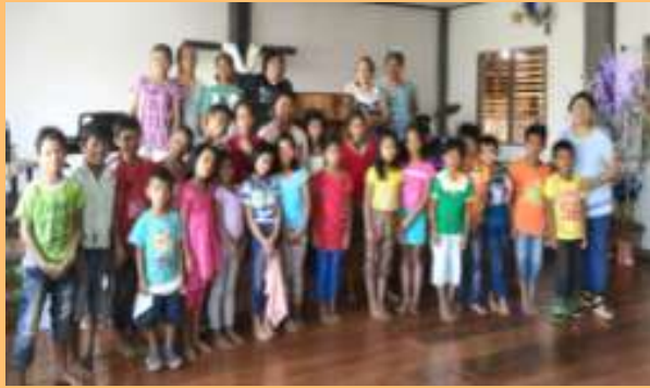
Christmas party for the lunch break Bible study participants at Lacolac Christian Fellowship on December 24, 2018

Our lunch break children Bible study participants came in the morning of December 24 for their Christmas party. With a lot of help from friends (who also sponsored the Christmas party in Mampang on December 16 and at the House of Hope Ministry Center in Opol on December 23), we were able to give Christmas presents aside from the party food. Again, the participants were not only ready to play group games, but were also prepared to recite memory verses.