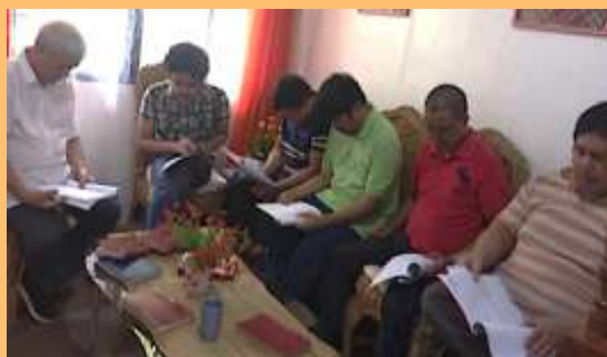
Men's discipleship class at the Portal Christian Fellowship

The get-together of youth and children from Kiraba and Molugan outreach areas brought a lot of excitement to the participants. They were not only ready to have fun, but they were also prepared to recite their memory verses, and answer Bible trivia questions. We will resume weekly meetings the first Saturday of January 2019.