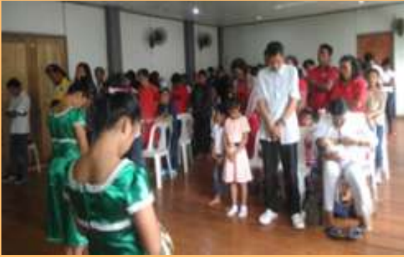
Worship service at Lacolac Christian Fellowship on December 23, 2018