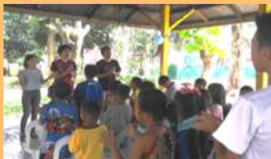
Kiraba and Molugan youth and children's Christmas Party with our outreach team

follow Him---to live as God intends them to live and to be where they need to be. May following Christ become their highest priority over any other pursuit in life.