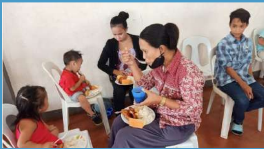
One of five Bajau families worshipping in Opol church