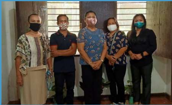
Lacolac Hillside Ministry Center VBS Team

all assemblies are limited to five people, and those 65 years old and above, and those 18 years old and below are not allowed to go outside of their places of residence. Since the beginning of the pandemic until now, we hold online Sunday worship services, Friday prayer meeting and Bible study, and Thursday youth fellowship online (even during the times when our quarantine status allow us to meet face-to-face) because we have families with young children and several church members with co-morbidities.