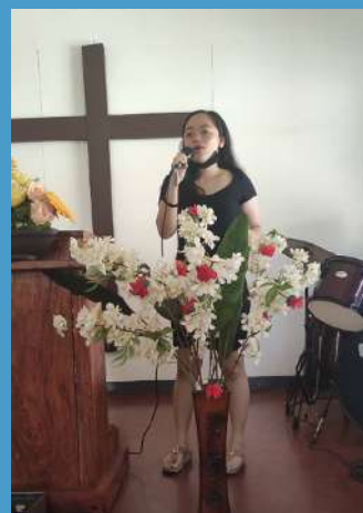
Public profession of faith of one of the ten participants of the recently concluded church membership class