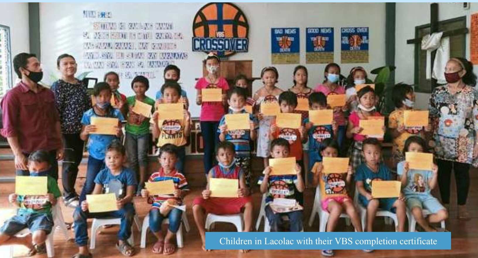
Children in Lacolac with their VBS completion certificate