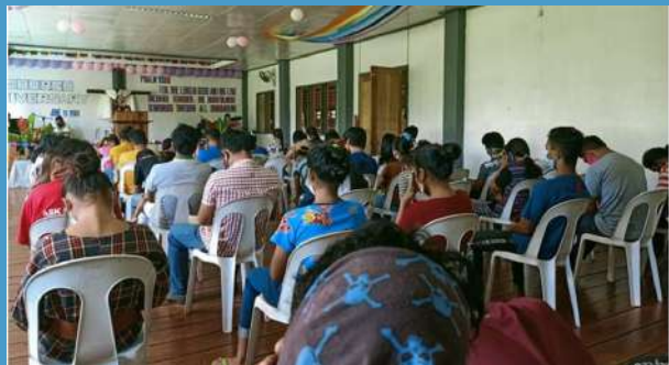
17 th church anniversary celebration in Lacolac

We are excited for the four families with whom we assisted in their farming livelihood projects (small backyard piggery, small backyard poultry, vegetable gardening such as bitter melon, eggplant, sweet potato, and cassava). Each project is now helping each family make both ends meet.