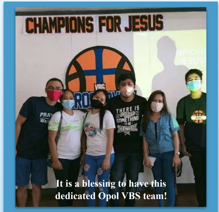
It is a blessing to have this dedicated Opol VBS team!

Praise God from whom all blessings flow! It has been our desire to hold a VBS for children and youth in Opol church to strengthen their faith through teaching the word of God and fun activities that remind them of the character of Champions for Jesus , our VBS theme. We prayed that the quarantine status of our community will continue to allow us to meet face-to-face (though we have to follow strict quarantine protocols). Finally, on the third week of May, we conducted the VBS. Everybody had a great time. Though it was physically demanding, the outcome was way worth all the effort, glory to God.