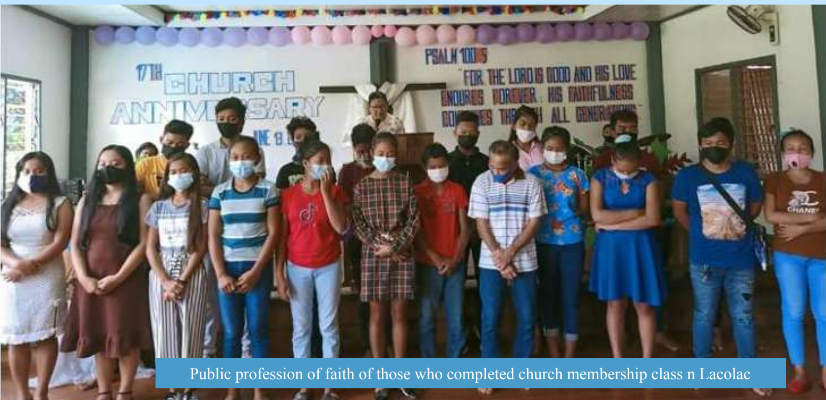
Public profession of faith of those who completed church membership class n Lacolac