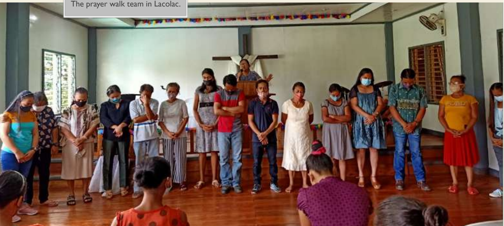
The prayer walk team in Lacolac.

In Lacolac , we were able to do most of the scheduled prayer walk ministry, in-person devotionals, Bible studies, cell group meetings, prayer meetings children and youth fellowship, and worship services, except during the 1 month lockdown we decided to impose upon the church since there were incidents of Covid positive residents (the elected community head passed away from Covid) but the local government decided not to place our community on lockdown upon finding out that there was not enough government funds to provide the essential needs of residents in the community.