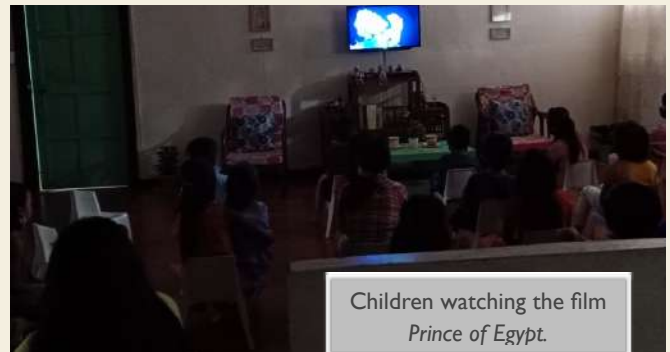
Children watching the film Prince of Egypt.

The Midway Presbyterian Church in Atlanta has recently approved our church building proposal for funding. We are grateful for their valuable and kind help, and rejoicing in the Lord's favor upon us. We would also like to thank you all, our constant and good-hearted partners in the ministry, for standing with us at all times. We remain humbled and appreciative of all that you do for us and the work both in prayer and practical help. You are precious to us!