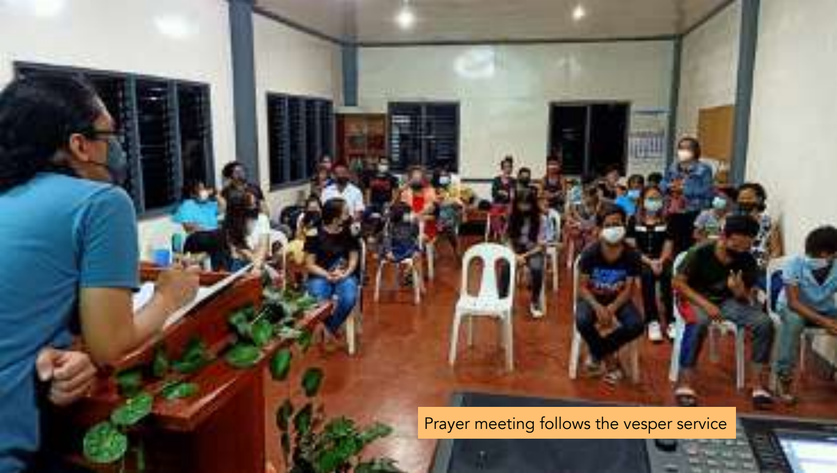
Prayer meeting follows the vesper service

As our city's Alert Level got downgraded to 1, our church decided to discontinue the online ministries effective March 13 (except for the Friday Bible study and prayer meeting) so that all will be encouraged to come for the face-to-face ministries: Sunday school, worship service, and other fellowship meetings.