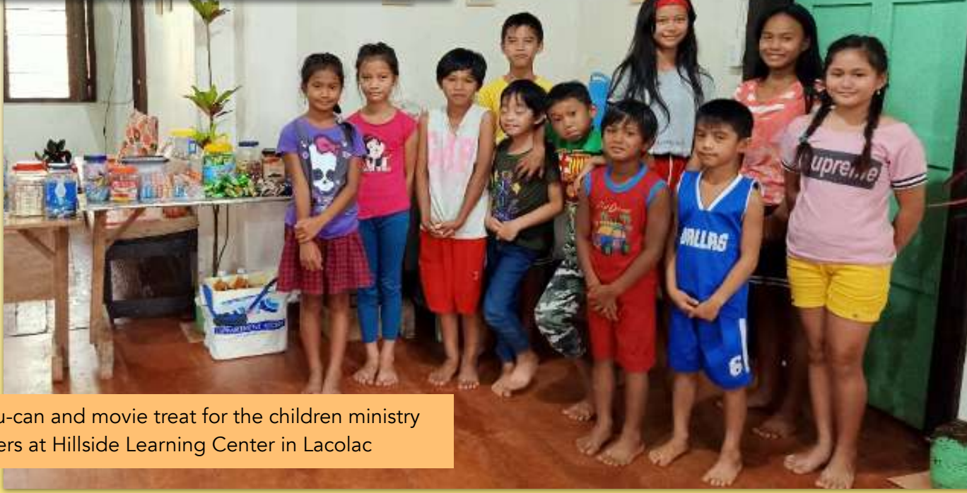
Eat-all-you-can and movie treat for the children ministry helpers at Hillside Learning Center in Lacolac

At the Hillside Learning Center in Lacolac, we have completed the preparation of teaching materials for the fast approaching summer DVBS. We still need to make the decorations, select the games, choose the songs, and come up with the schedule of daily DVBS program of activities. Then, we will conduct the DVBS team training and workshop. Soon after the national elections (please pray with us for a peaceful and honest elections on May 9), we will hold DVBS in 3 venues: Opol, Lacolac, and Zamboanga City.