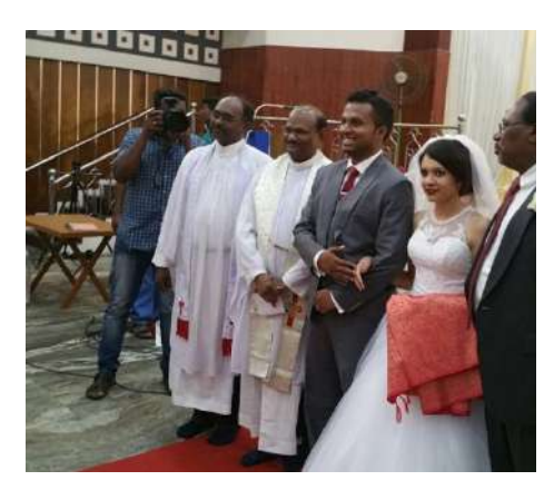
The red Sari, in her right