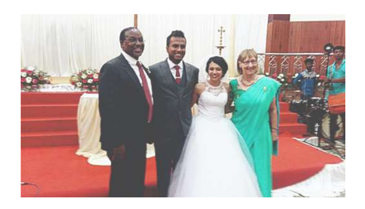
After wedding, our faces all show great happiness. each other.