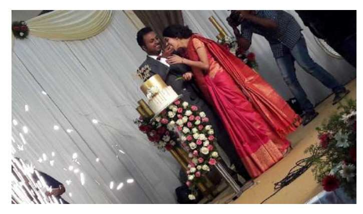
The pair cut a cake at Church and fed