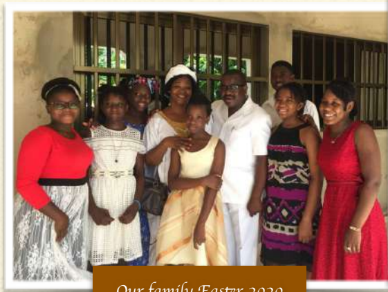
Our family Easter 2020