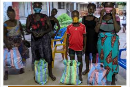
36 widows receive food during the pandemic thanks to your support

Thank you for your support, encouragement, love and care. We still need you to continue this wonderful journey with us of marriage and ministry. Please pray for us.