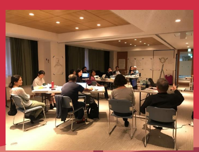
Workshop by Trauma Healing Institute