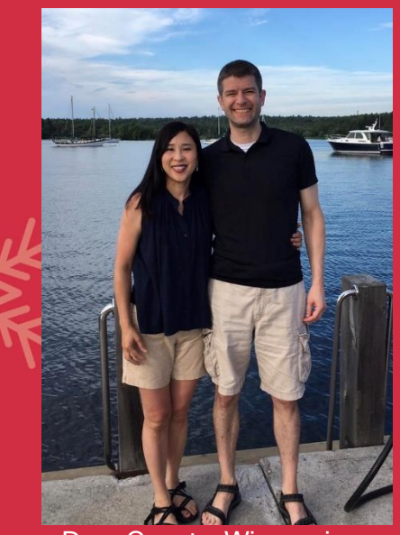
Door County, Wisconsin (Summer trip to U.S.)

I am encouraged by these two opportunities because they show that Japanese churches are beginning to recognize the importance of counseling and how it can bring healing to the suffering and pain in people's lives. On the other hand, these opportunities are also a reminder to me that there is still a lot to learn about the effects and treatment of trauma.