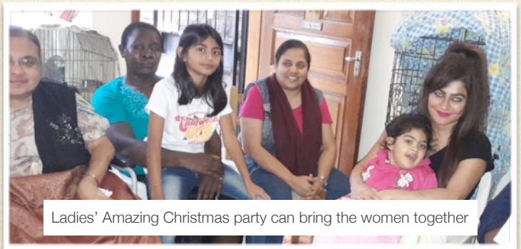
Ladies' Amazing Christmas party can bring the women together