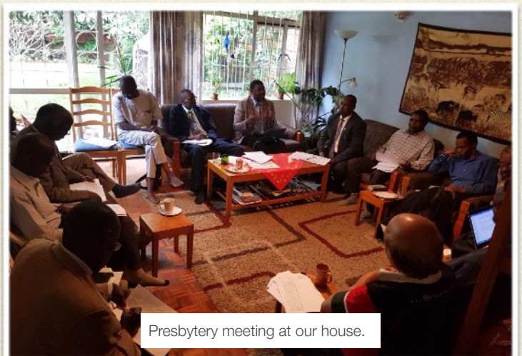
Presbytery meeting at our house.