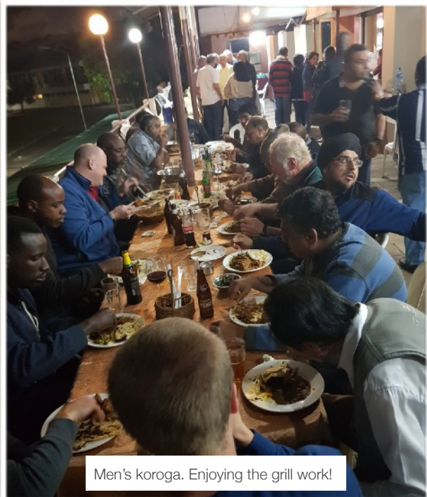
Men's koroga. Enjoying the grill work!