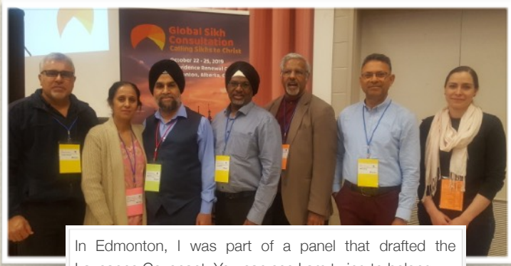
In Edmonton, I was part of a panel that drafted the Lausanne Covenant. You can see I am trying to belong.