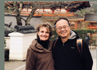
We celebrated 32 years of marriage last month. Praise God for His faithfulness over 25 years in Japan as an international couple raising bi-cultural children.

PRAY FOR spiritual growth for all of us and for salvation for three of the members.