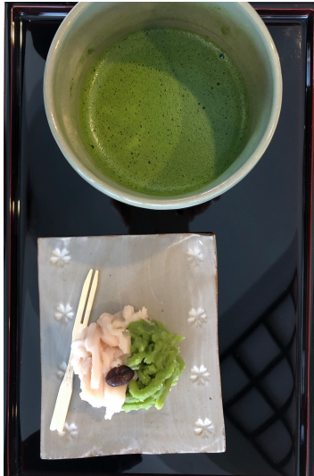
Green tea and wagashi , a rice flour sweet: This one was made for plum tree flowering season in Kyoto.

Christian Leadership Framework and the accompanying 365 Survey is an adaptable software that CitytoCity Japan plans to use to evaluate potential church planters. It has been translated into Japanese, and from the available 40 leadership framework skills our group has chosen 10 skills necessary for church planting in a Japanese setting.