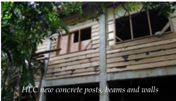
HLC new concrete posts, beams and walls

July was quite a busy month for us as repair work of the Hillside Learning Center in Lacolac was a bit demanding in terms of transporting building materials and supervising work of various carpenters with different attitude towards work, and ongoing ministry programs in all 4 ministry centers.