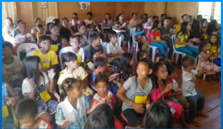
VBS participants at Mampang Ministry Center in Zamboanga City

While we were working on the fence, we observed children, youth and adults mostly carrying slingshots shouting, whistling, creating noises to attract the attention of our dogs. When our dogs ran to them barking, they started to hit the dogs with their slingshots like it was nothing. Other adults did not stop them in any way. So we scolded them, at the same time calling our dogs in. One neighbour told us that farm animals were maimed, even killed this way. And no one dared report them to the authorities. One day while we were there, soldiers and anti-drug police officers came for raid operations in this relocation community. We covet your prayers for God's protection as we continue to serve Him in this place.