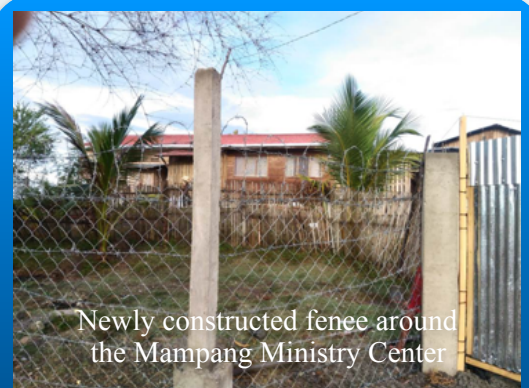
Newly constructed fence around the Mampang Ministry Center