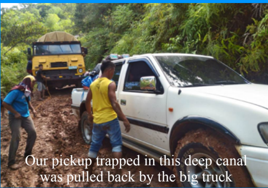
Our pickup trapped in this deep canal was pulled back by the big truck

During the dry season, we focused on the procurement and transport of building construction materials for our ministry building repairs. We are scheduled to start the building repair work this month of July. The carpenters, who are church members, have also been engaged in working for government projects such as school building and road/bridge construction. We cannot compete with government daily rates, but we remain grateful to our carpenters for prioritizing the church repair work.