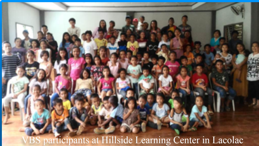
VBS participants at Hillside Learning Center in Lacolac