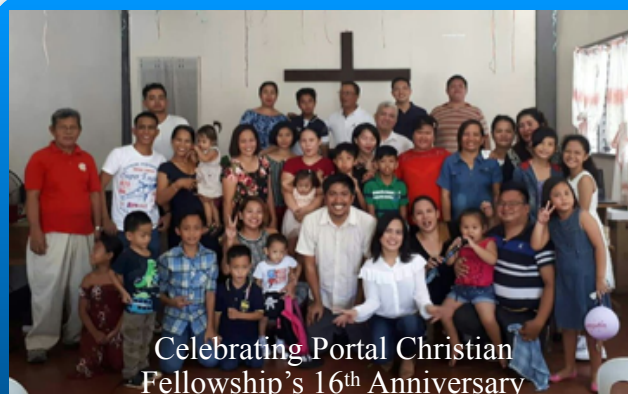
Celebrating Portal Christian Fellowship's 16 th Anniversary

The month of June we celebrated 2 church anniversaries. The Portal Christian Fellowship celebrated its 16 th anniversary . This year it is made more special by the presence of our Bajau/ Sama worshippers. Since the first quarter of this year, we have been holding joint Sunday worship services for the Portal Christian Fellowship and