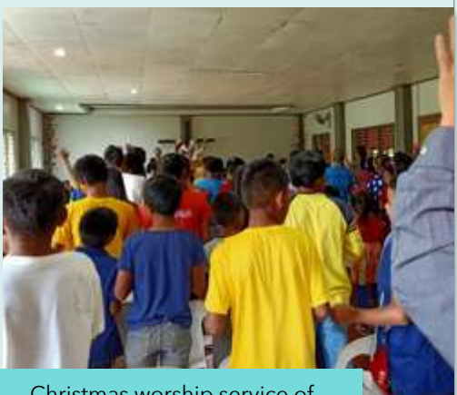
Christmas worship service of Lacolac Christian Fellowship

only cover shortfalls, but also incoming needs, and funds to purchase a much needed second-hand pickup truck. We are overwhelmed with gratitude both to God and to all of you dear friends. Thank you for the blessing of your thoughtfulness and kindness, refreshing us in countless ways.